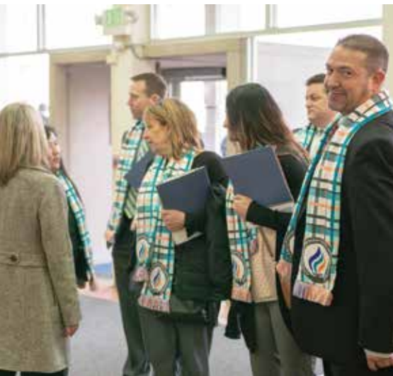
AWSP Board and AWSP Advocacy Committee members make the principal voice heard in Olympia.

A huge thanks to those who traveled to Olympia to spend time meeting with legislators. Anyone can be an advocate and if you are interested in getting involved in advocacy efforts for AWSP, contact me! ■