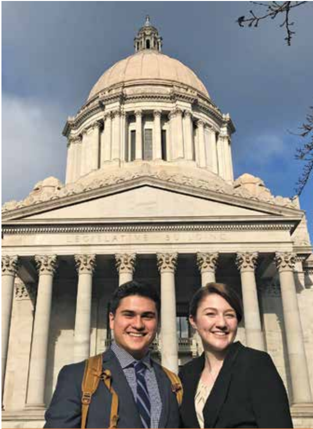
Government, Politics and Law – Independent Study | 04197 (in cooperation with the State Board of Education Student representatives)

This course enables students to explore topics of interest within one of the fields of Government, Politics, and Law. These courses may provide students with an opportunity to expand their expertise in a particular specialization, to explore a topic of special interest, or to develop more advanced skills.