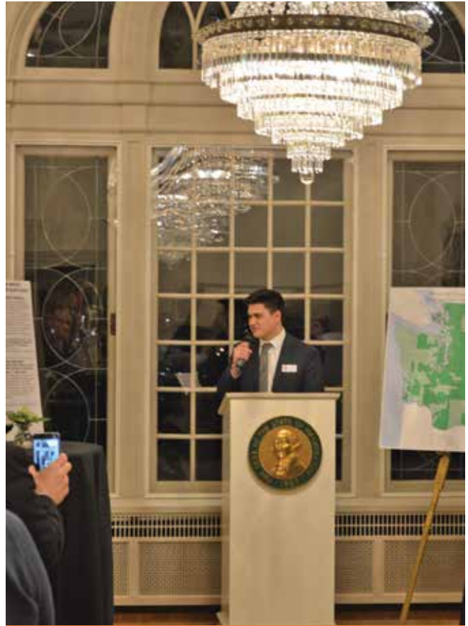
Public Policy | 15203 (in cooperation with the State Board of Education Student representatives)

This course enables students to explore topics of interest within one of the fields of Government, Politics, and Law. These courses may provide students with an opportunity to expand their expertise in a particular specialization, to explore a topic of special interest, or to develop more advanced skills.