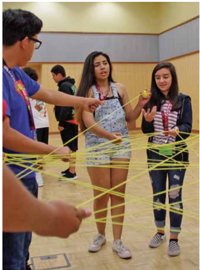
Dropout Prevention | 22004 “Dare to Dream: Exploring Your Future”

Thanks to the vision and support of principals across the state of Washington, this initiative has far reaching benefits for students, administrators, and families. Our future is bright as we plan to add more classes and offerings to our course list.