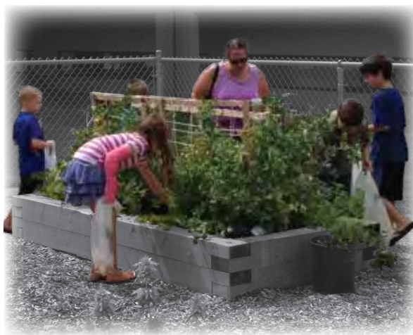
Students at Cooper Elementary work together in the school garden.

These students and others spent part of their summer