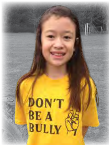
Brinnon School students don their "Don't Be a Bully" shirts every Thursday.

Students also signed a pledge to keep the school bully-free. In addition, the school is moving forward with a partnership with a neighboring school district to implement a positive school climate curriculum to further support these efforts.