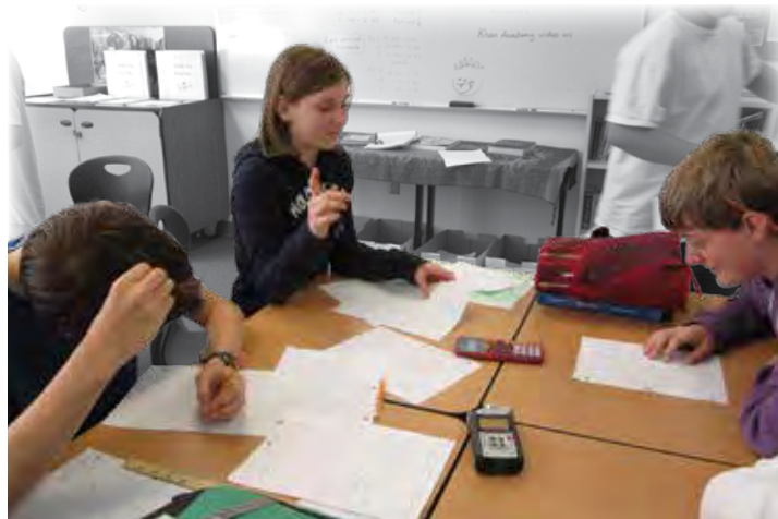
Middle school students tackle real-world math problems as part of Vashon Island School District's Real Time Math Project.

Architects and engineers brought the design problems of the project into middle-school classrooms. How should the stairwells be built to both comply with code and promote