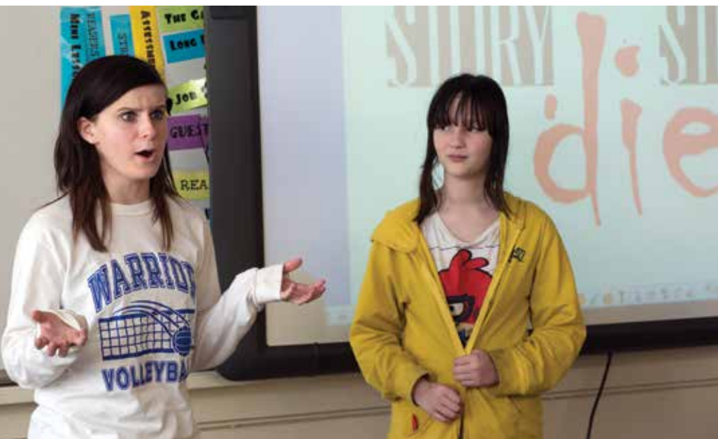
Forks Middle School students engaged in "Story, Story... Die," a student favorite in Theater Sports, an enrichment class focused on theater improvisation.