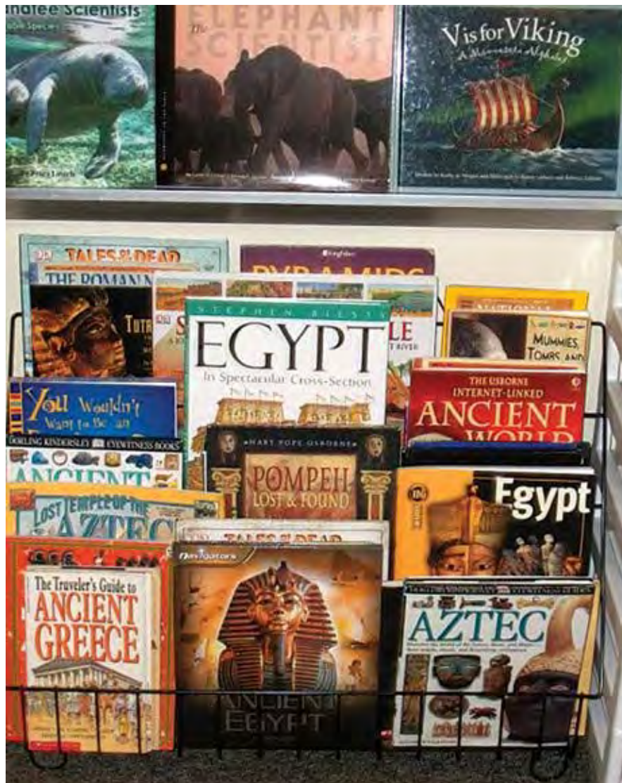
Offer students a range of nonfiction texts and encourage browsing.

Donalyn Miller will speak at the 2014 AWSP/ WASA Summer Conference, June 29 – July 1, in Spokane. Learn more at www.awsp.org/summerconference .