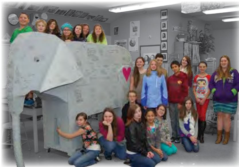
Elephant ‘Rosie’ gives Lake Stevens Middle School students a place to write down their thoughts and feelings when they’re going through a tough time.